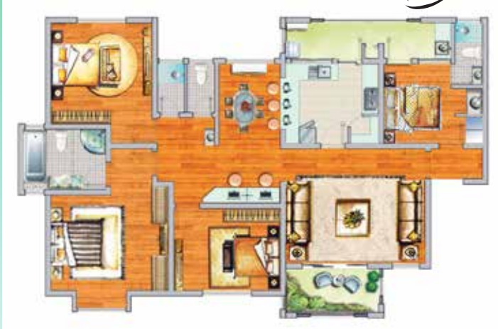
120 units of 3 bedroom with DSQ