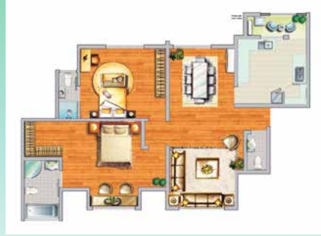
30 units of 2 bedroom