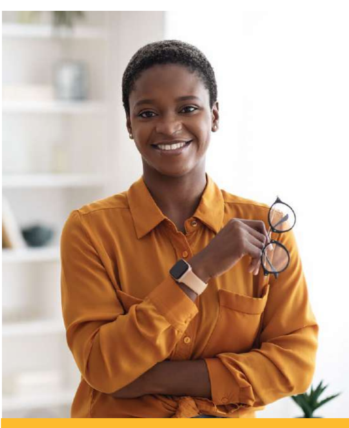
Are you a woman looking to grow your business and achieve financial independence? Look no further than NIA, the product designed specifically for women entrepreneurs.

Nia ( Passion and intent/intention ) seeks to provide women entrepreneurs/professionals with access to financial solutions, capacity building, mentorship, customer experience and even networking opportunities to help them grow their businesses.